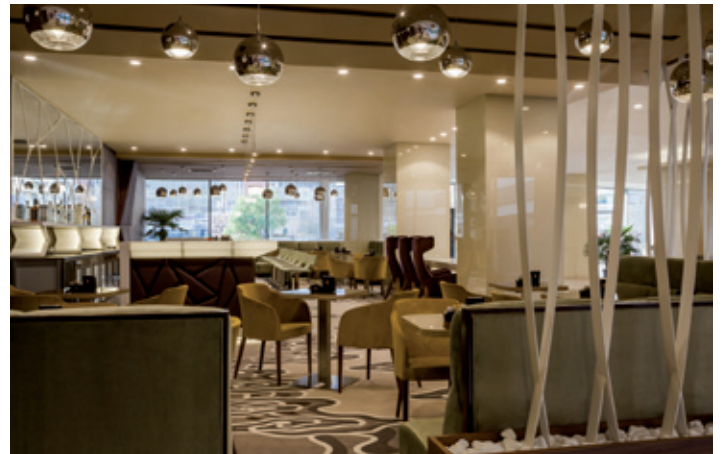
RAMADA PLAZA (CRAIOVA)