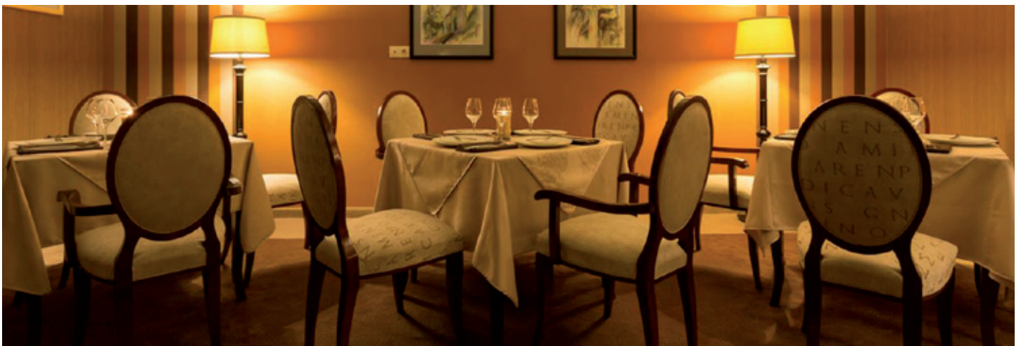
ART HOTEL (CAREI)