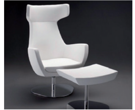
PL 517 + POUF