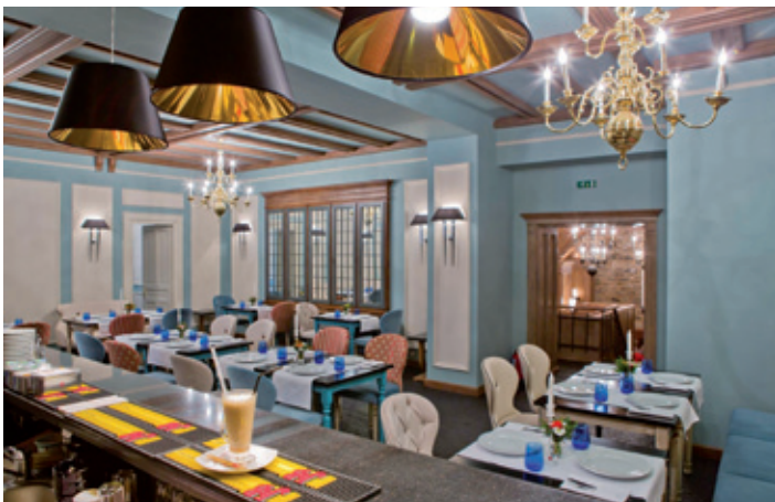
CASTEL CANTACUZINO (BUSTENI)