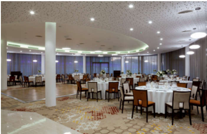
RAMADA PLAZA (CRAIOVA)