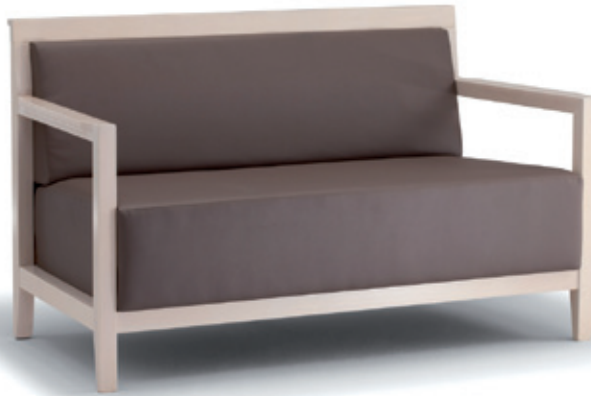
PL 1303 DIV-1